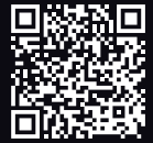
TRB500 360° VIEW

// The TRB500 gateway is a compact-sized and energy-efficient industrial gateway with a Gigabit Ethernet interface and two configurable I/Os, allowing high-level customization and implementation of a multitude of scenarios.